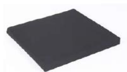
Seat cushion, cover with zipper, black