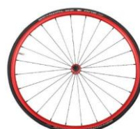
Lightweight wheel, anodized red