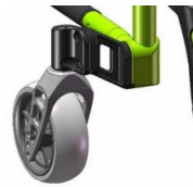
Expansion kit, designed for hemiplegic users