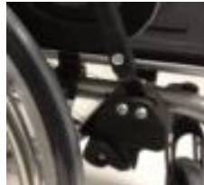
One arm wheel lock