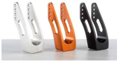
Fork Aluminium, black, orange & silver