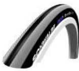
Right Run Tyre