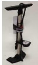
High pressure pump