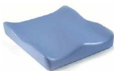
Jay Soft Combi P (picture shown without upholstery)