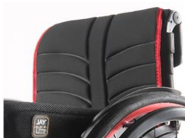
EXO backrest sling (EXO