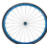
Lightweight wheel, anodized blue