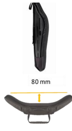
JAY J3 Back Mid Contour