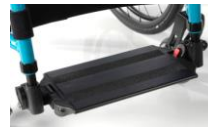
Platform, angle and depth adjustable; flip up, aluminium with locking system