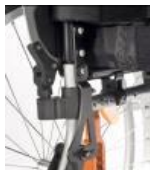
Angle adjustable back -12° to 12°