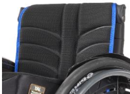
EXO PRO backrest sling (EXO Evo version)