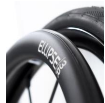
Ellipse 3R Handrim