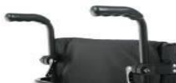
Height adjustable push handles