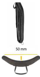
JAY J3 Back Shallow Contour