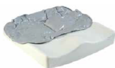
Jay Easy Fluid (picture shown without upholstery)