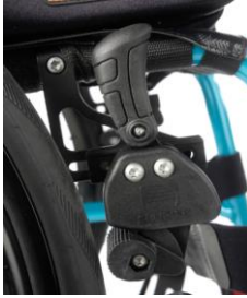
Knee lever wheel lock