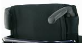
Fold down push