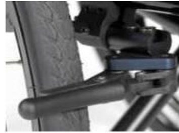
Compact wheel lock