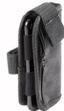
Mobile phone pocket