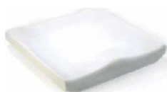
Jay Basic (picture shown without upholstery)