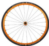
Lightweight wheel, anodized orange