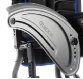
Sideguard alu with fender