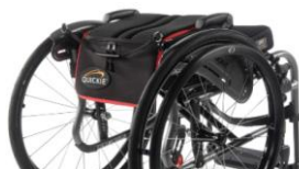
Backrest, fold down (to the front)