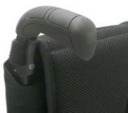
Push handles long